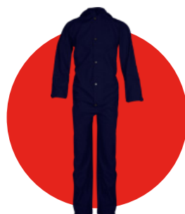
WARONA 5400 Art. no. 2.45.400.00