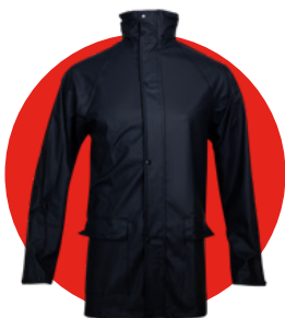
WALAKA 5200 Art. no. 2.45.200.00